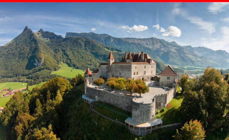
Gruyère Castle, Gruyère village